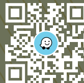
IOI Galleria @ Bandar Putra Kulai