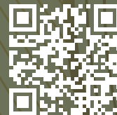
Scan here for more info

IOI GALLERIA @ BANDAR PUTRA KULAI Open Daily: 9AM ~ 5PM