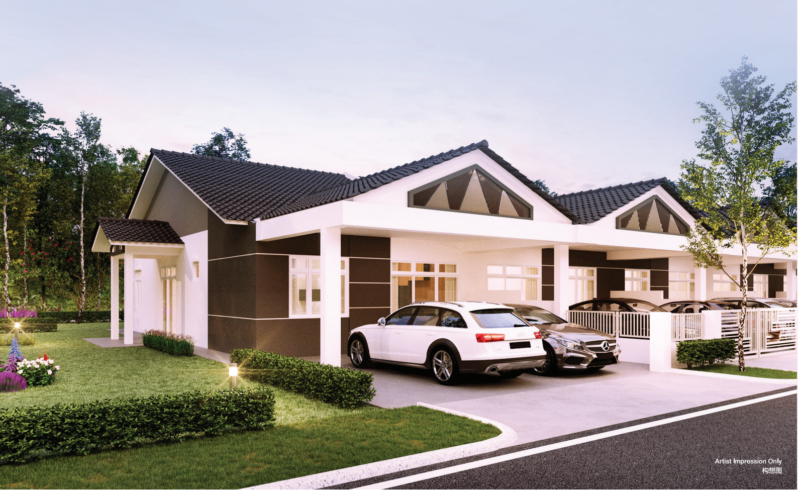
Artist Impression Only 构想图

PICCOLO offers thoughtful and large living spaces where you can create your ideal home easily.