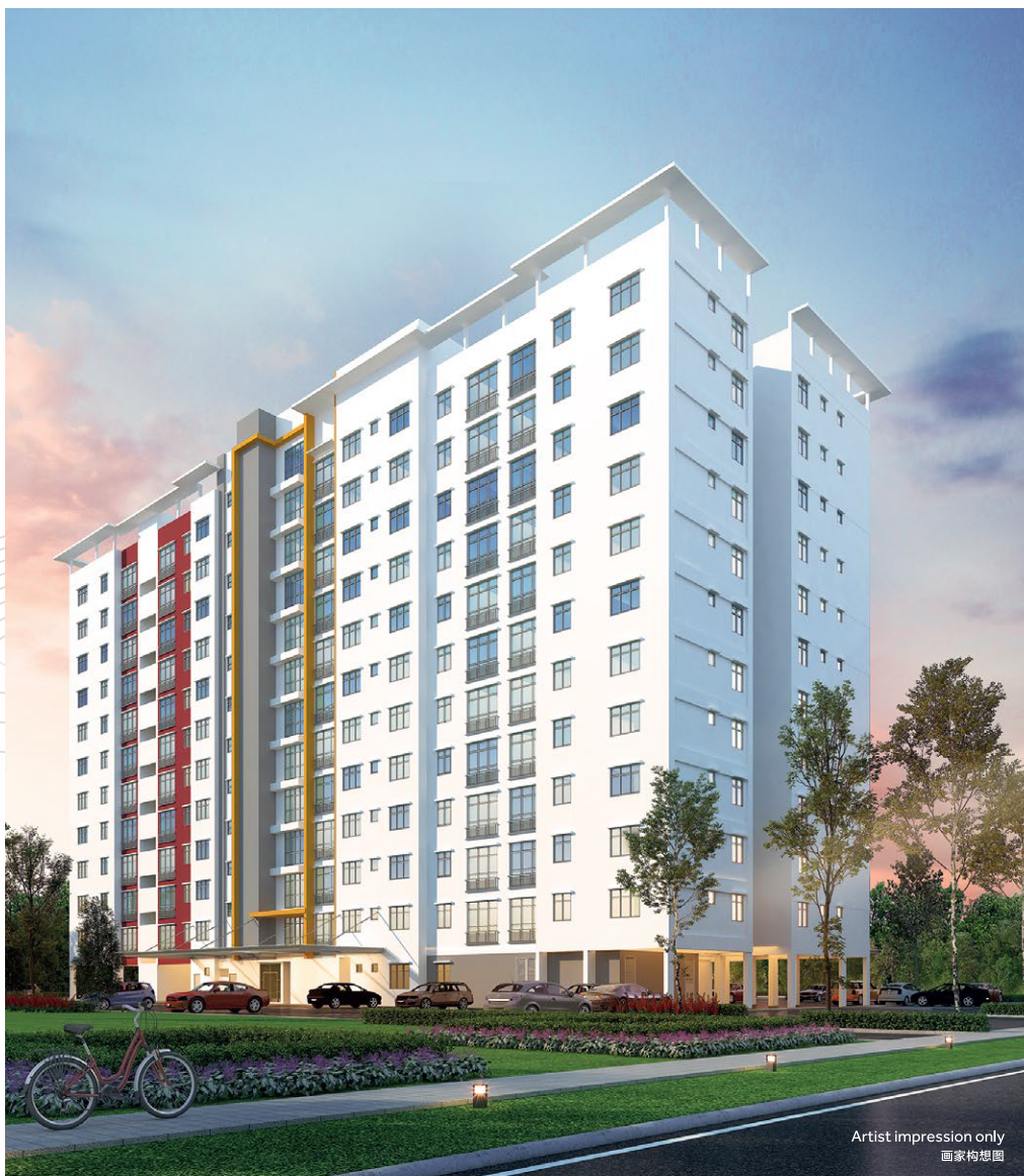
Artist impression only 画家构想图