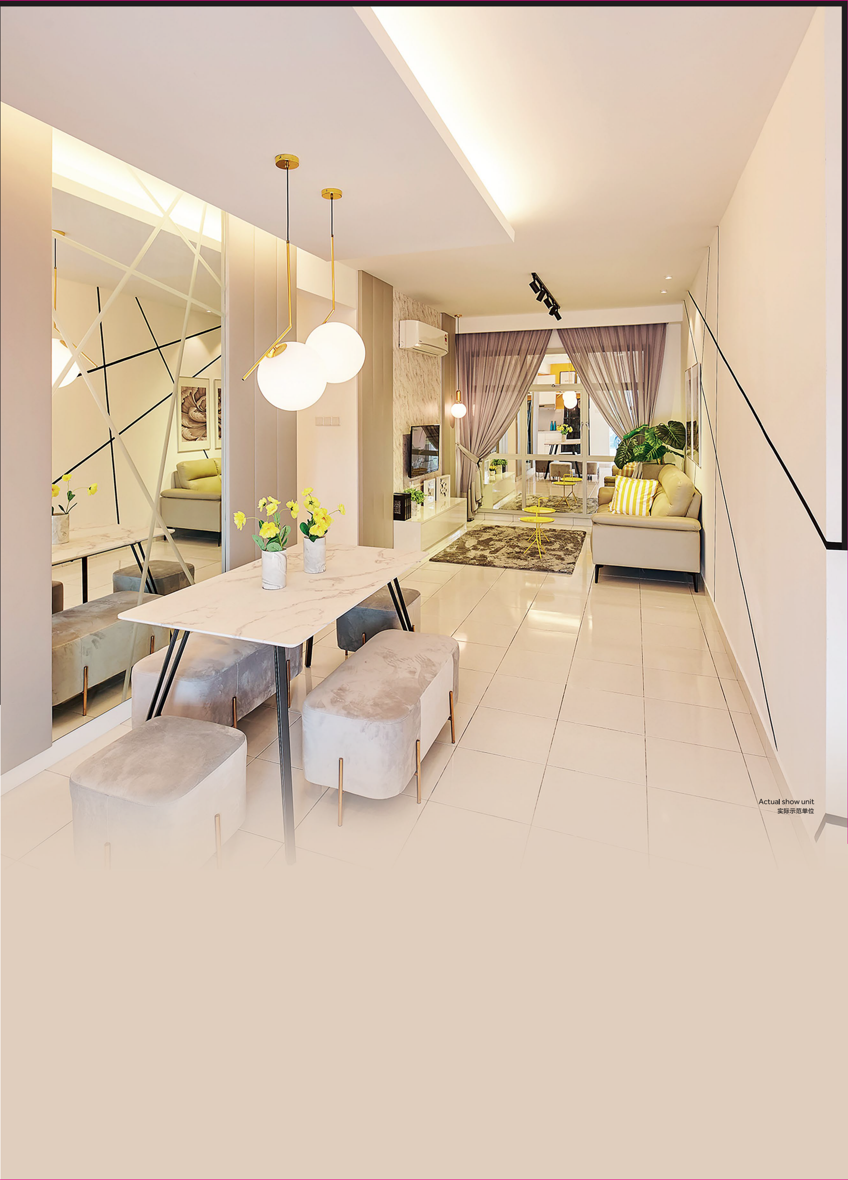
Actual show unit 实际示范单位