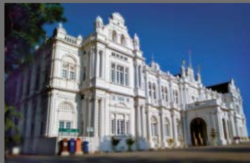
Penang Council Building

Be it lush tropical gardens or ornately designed temples and unique heritage buildings, Penang will give you a glimpse into a world where nature, tradition and history blend into a rich cultural tapestry.