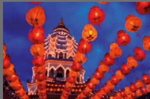
Kek Lok Si Temple