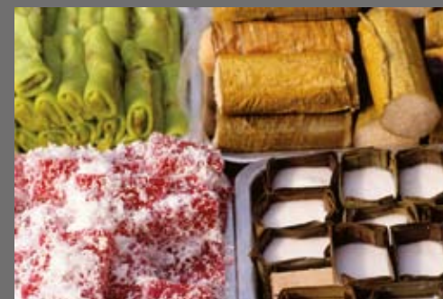
Well-known Penang delicacies