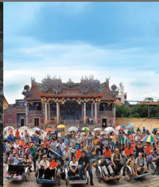
Khoo Kongsi, Canon Square - a well-known landmark

Listed as “an island you must visit” by CNN Travel in 2011, Penang embraces modernity while retaining its traditions and old world charm. Offering the best of Asia, Penang’s sights and sounds reflect the colourful heritage of its people.