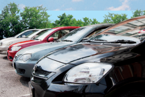
Ample car parks