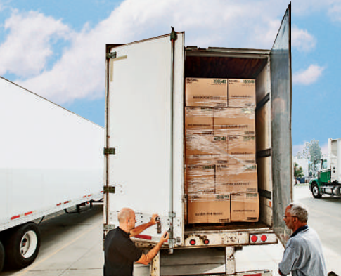
Wide internal roads